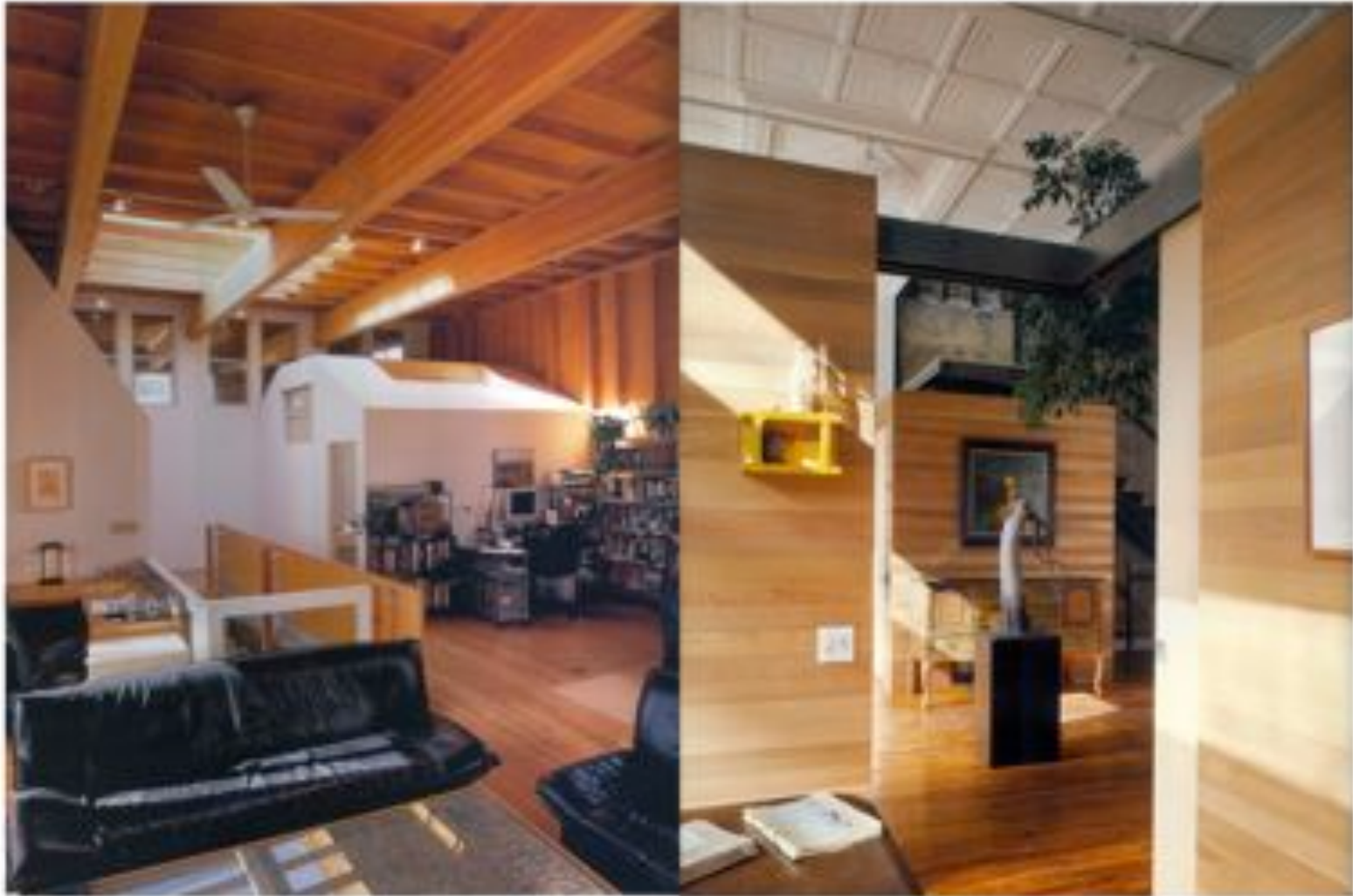
space for art, space for living, space for space, and even a tin ceiling