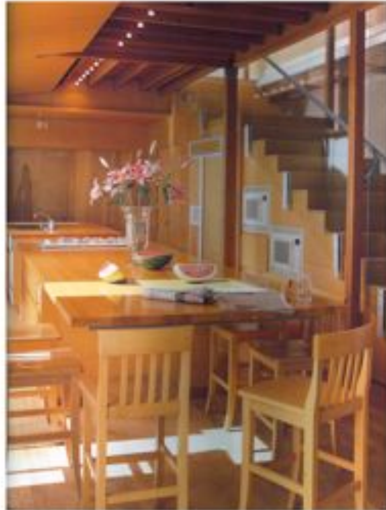
a kitchen that almost doesn't seem to be one