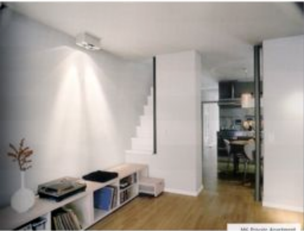
ABC Private Apartment