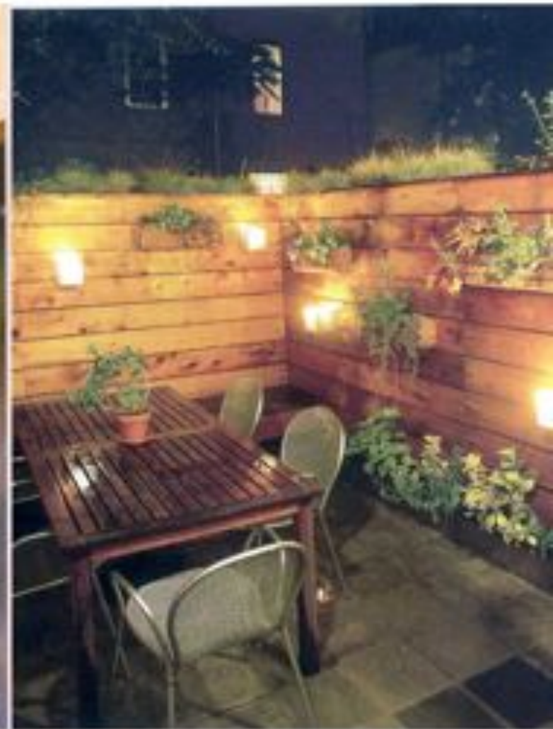
the patio both looks good and flows with the house. this one is somewhere on capitol hill