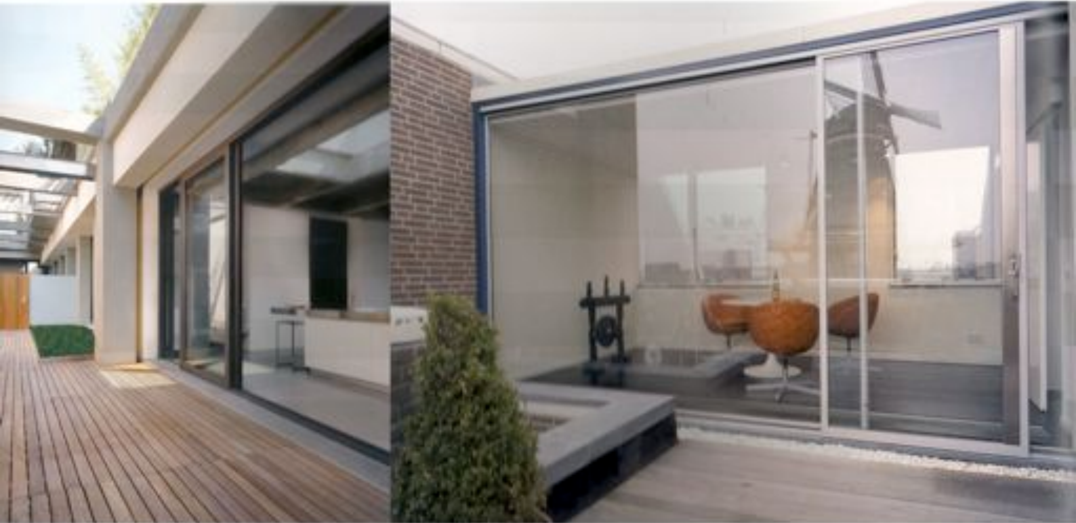
balconies and decks we like