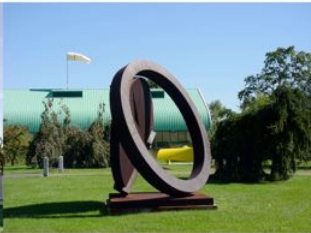
the pavillon - a soft box of glass, steel and concrete, but very much part of its natural setting